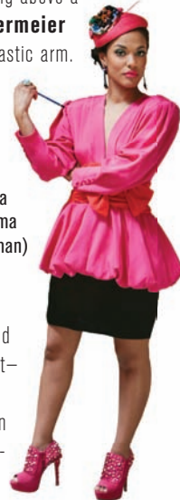
Larissa (Freema Agyeman)